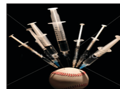
Anti Doping Services