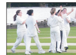
Women Athlete Clinic