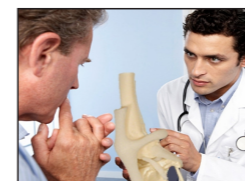
Patient Education & Social Awareness