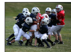
Young Athlete Clinic