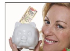
Cost Effective Packages