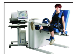
Sports rehab and Performance Enhancement